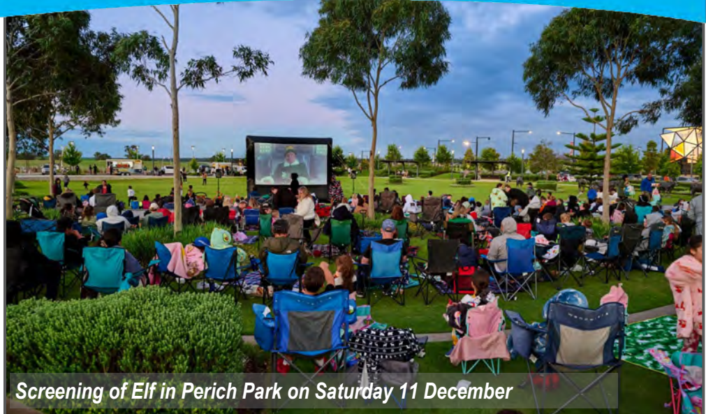
Screening of Elf in Perich Park on Saturday 11 December

We hope you have enjoyed all the Christmas activities organised by