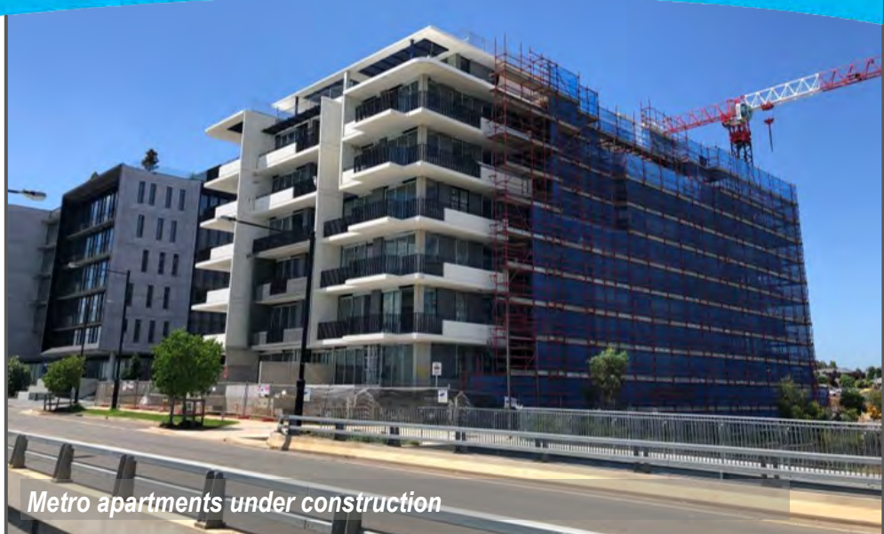
Metro apartments under construction

Updates on all land registration dates can be found on our website www.oranparktown.com.au