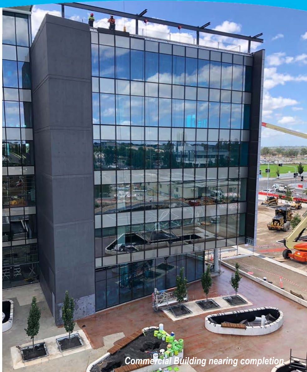
Commercial Building nearing completion

For more information, contact Hume Region Scouts on Ph 4628 4994 or hume.region@nsw.scouts.com.au