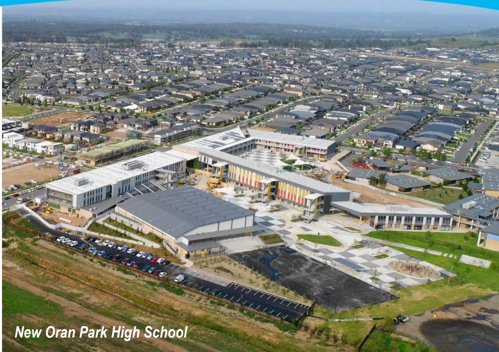
New Oran Park High School

Headspace Campbelltown are also looking for volunteers to be part of their