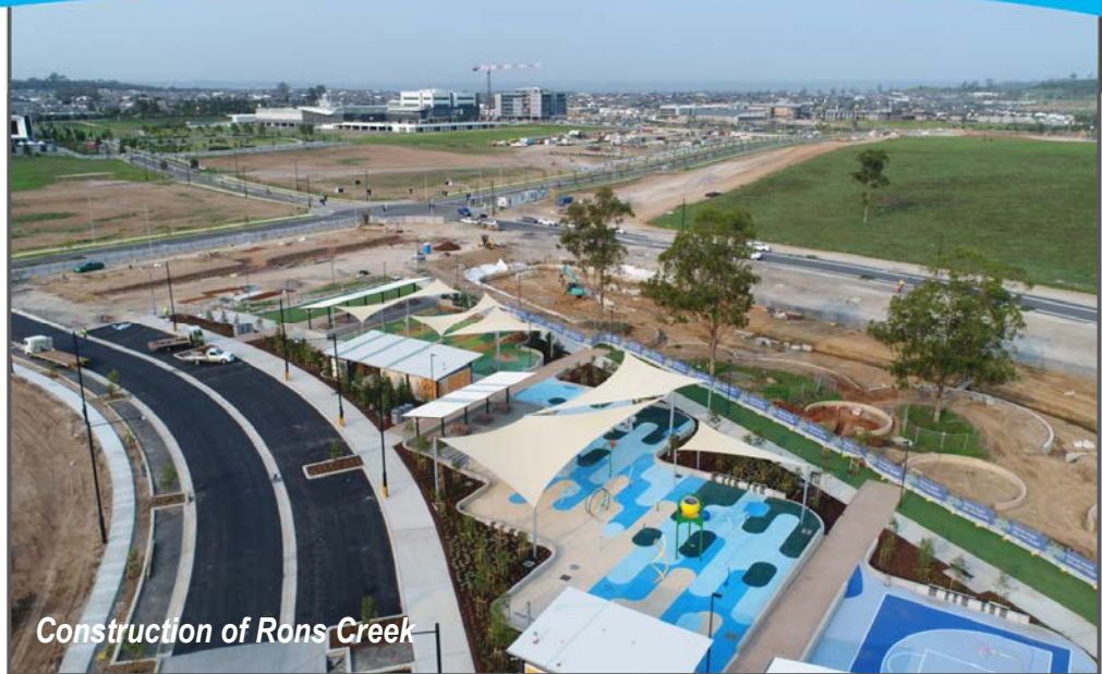
Construction of Rons Creek

We have achieved the major approvals for the connection of Dick Johnson