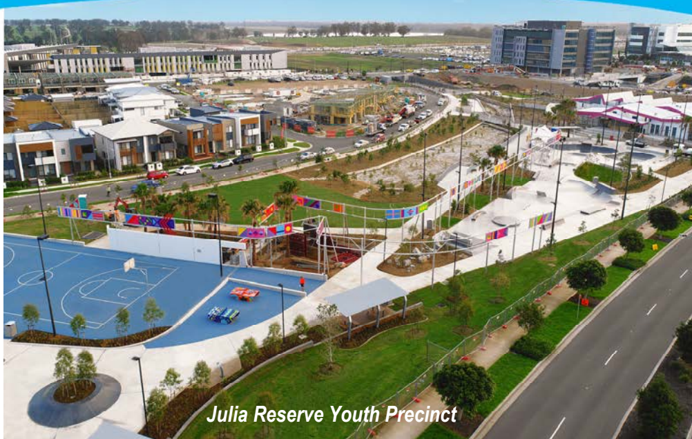
Julia Reserve Youth Precinct

Please bear with us as work continues on parts of the park that are not complete. For the next few weeks works will continue on completing the parkour area, paths to the north of the site and installing the artwork on the mural wall adjacent to the basketball