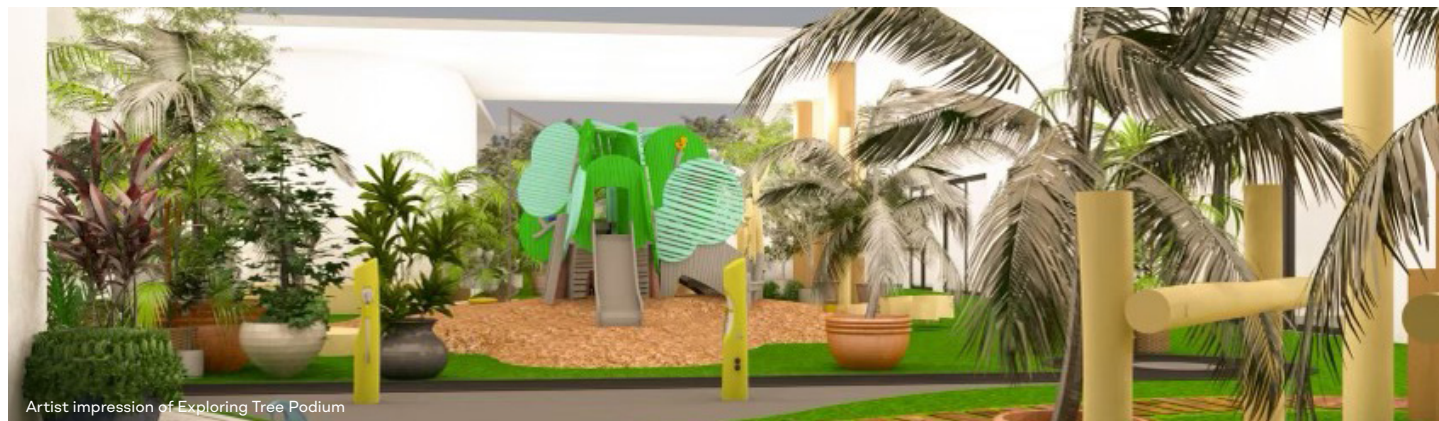
Artist impression of Exploring Tree Podium