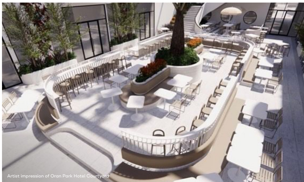
Artist impression of Oran Park Hotel Courtyard

Construction continues on our next commercial building adjacent to TRN House, with the southern half of the structure now complete and "topped out", while the northern half of the building has been poured to level 3.