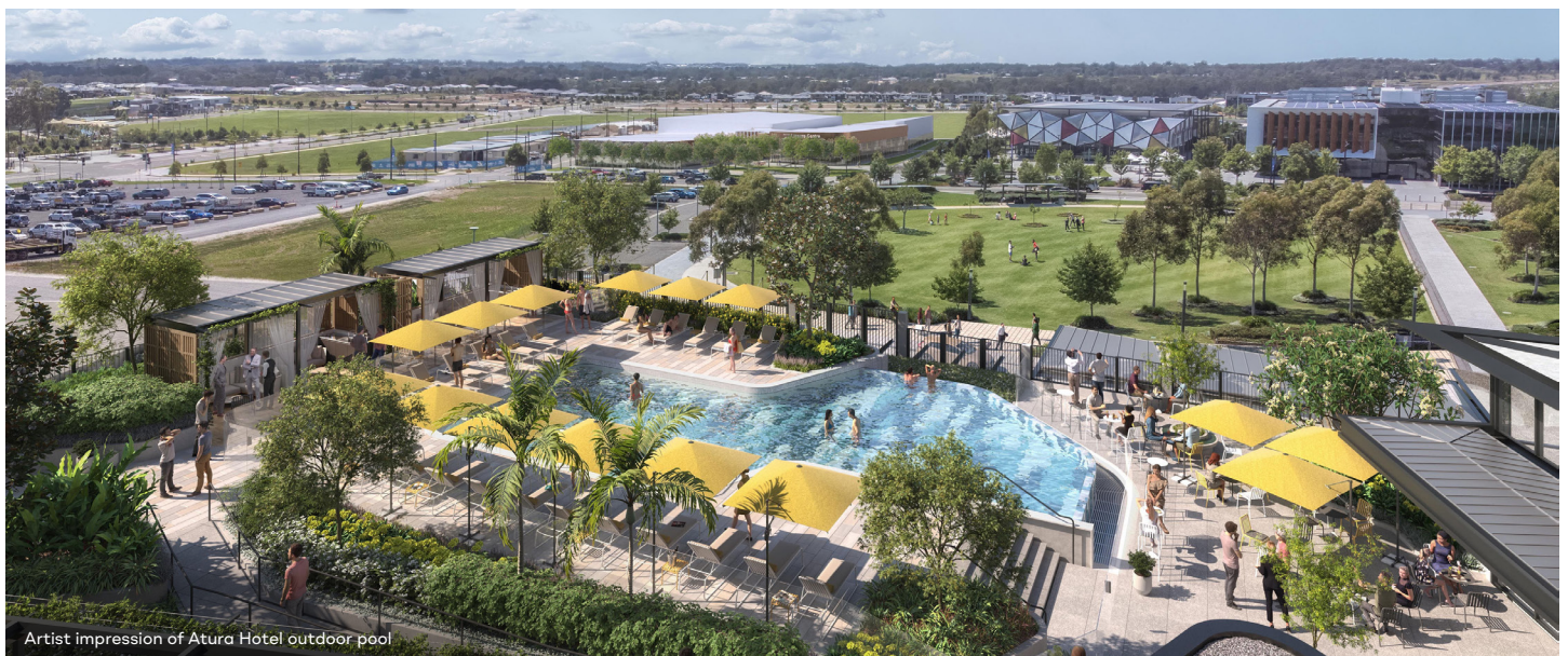
Artist impression of Atura Hotel outdoor pool

A DA for the Atura Hotel has been lodged with Council. The Hotel will be located between Perich Park and Stage 2 of the Podium which is currently under construction. The development includes more retail spaces on the ground floor and a 184 room hotel also featuring generous conference and meeting facilities. Entry to the hotel will be from level 1 which will also provide access to the restaurant, bar and outdoor pool.