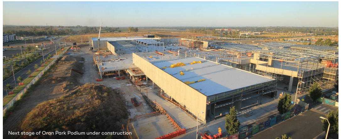
Next stage of Oran Park Podium under construction

The DA for the new baseball facility near Barramurra Public School has been DA approved and preparation of CC documentation continues. Stage 1 of the facility includes a full-size competition baseball field, amenities building and car park. Completion is expected early 2024.