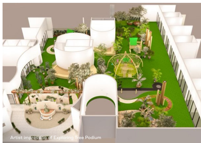
Artist impression of Exploring Tree Podium

For enrolment enquiries, email podium@exploringtree.com.au