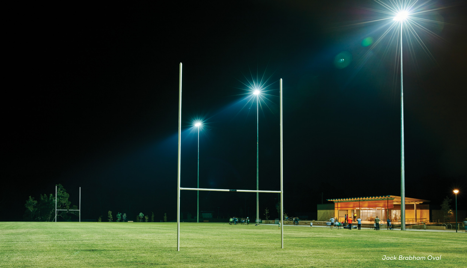
Jack Brabham Oval