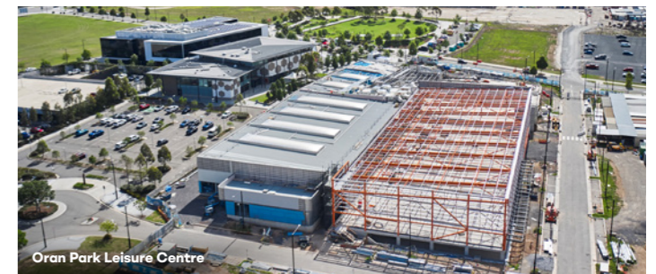
Oran Park Leisure Centre