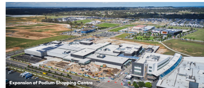
Expansion of Podium Shopping Centre

Expected completion is likely to be mid-2024 and open to the public shortly after.