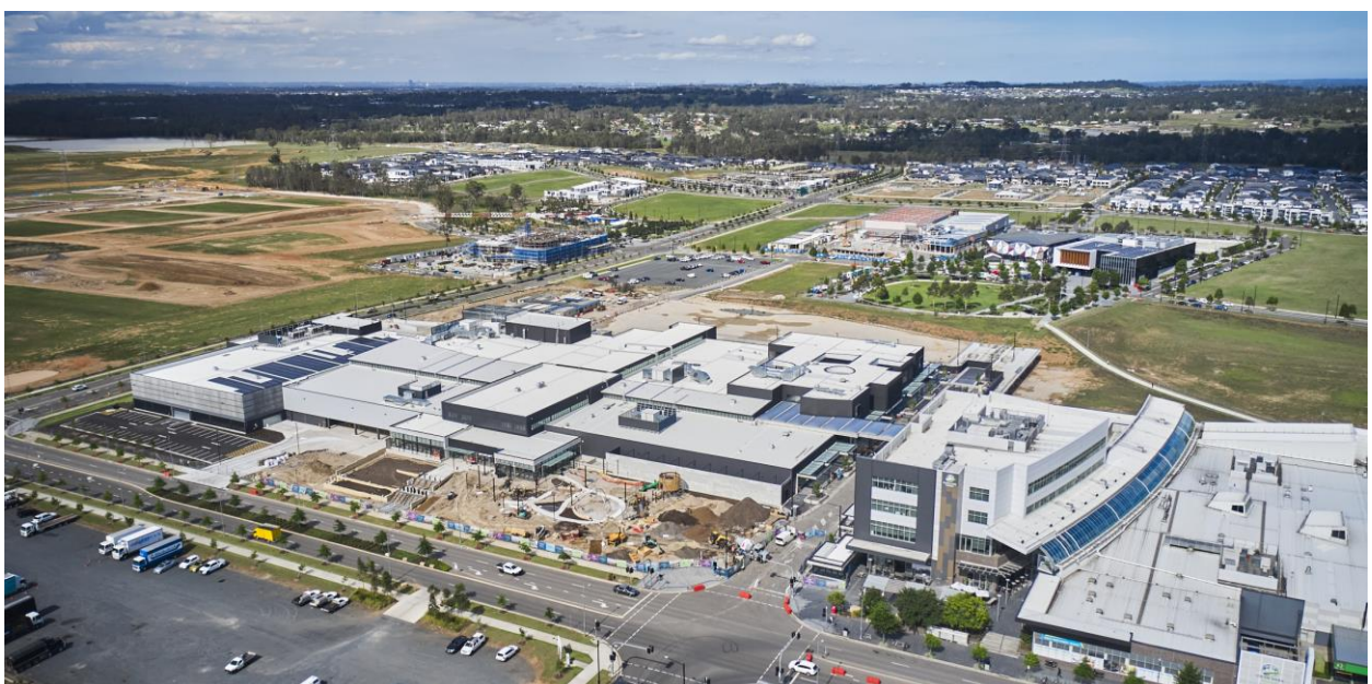
Aerial image of Podium Shopping Centre