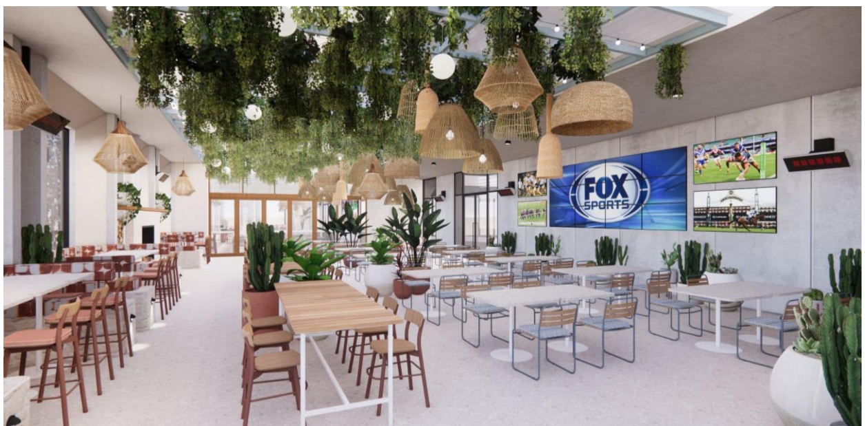
Artist Impression of Sports Bar