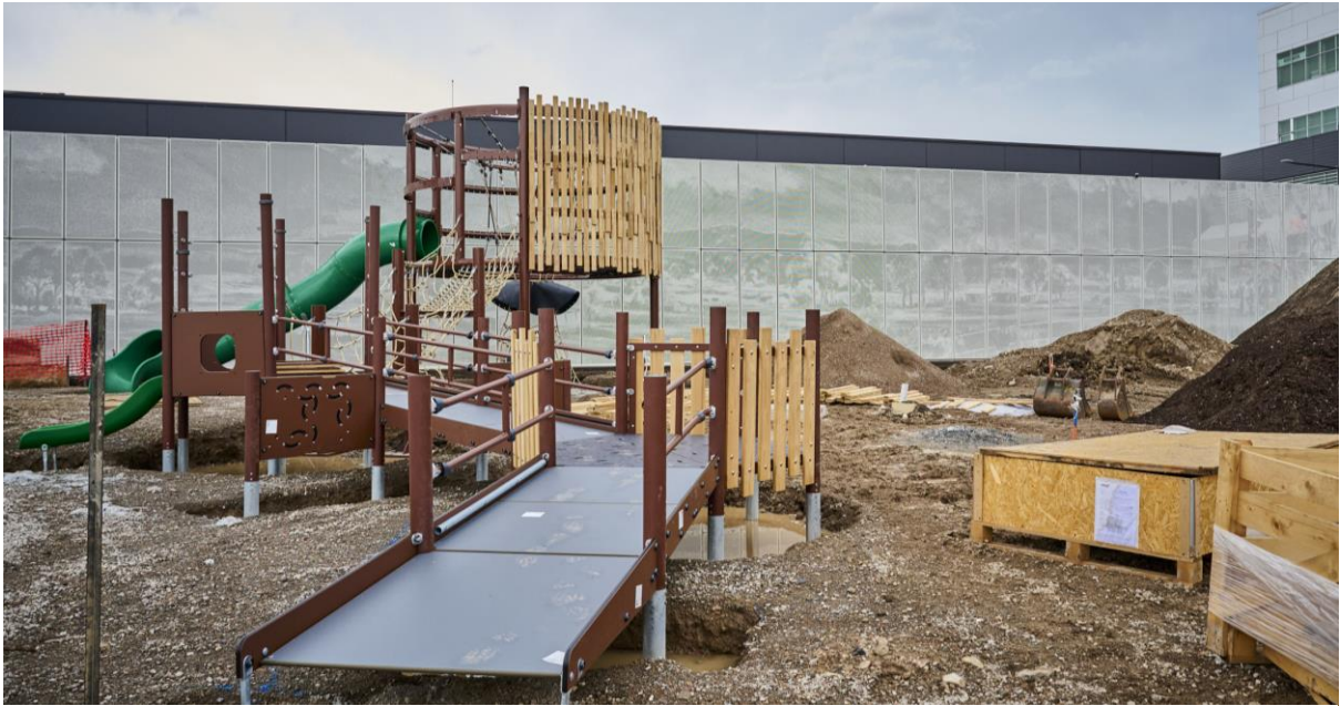
Play equipment being installed adjacent to Podium Stage 2