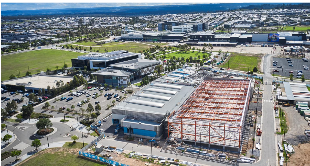
Oran Park Leisure Centre under construction