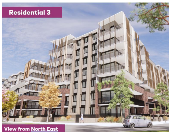
View from North East