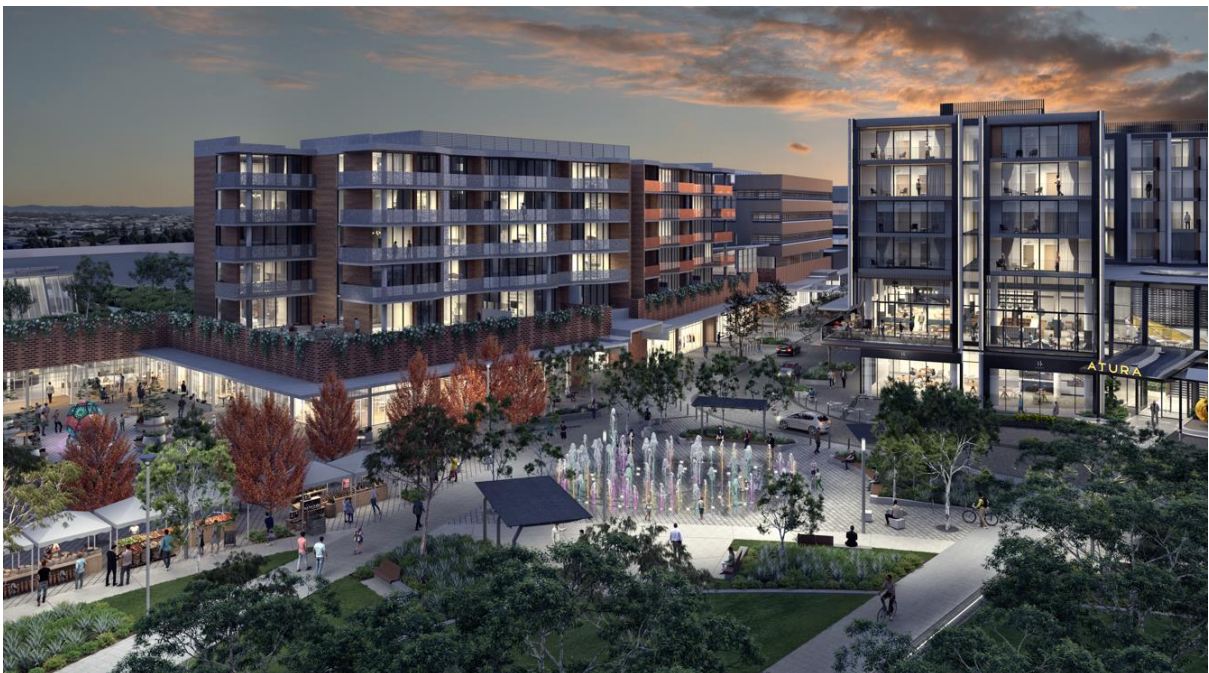
Relocated Town Square and new water feature adjacent to Perich Park

The revised Masterplan allows for the relocation of the town square to an area that will overlook Perich Park. This location provides much better solar access and weather protection as opposed to the original location near the Atura Hotel. It also allows approvals to progress on buildings in the town centre and improves pedestrian connectivity.