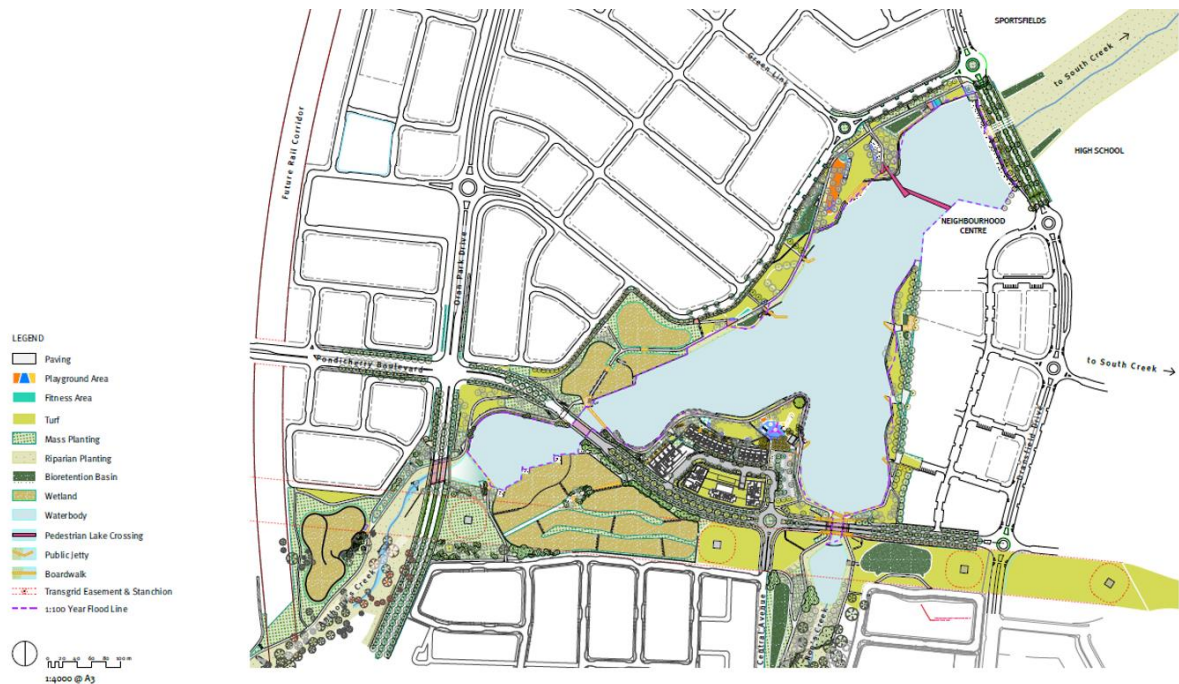
Proposed Pondicherry Lake