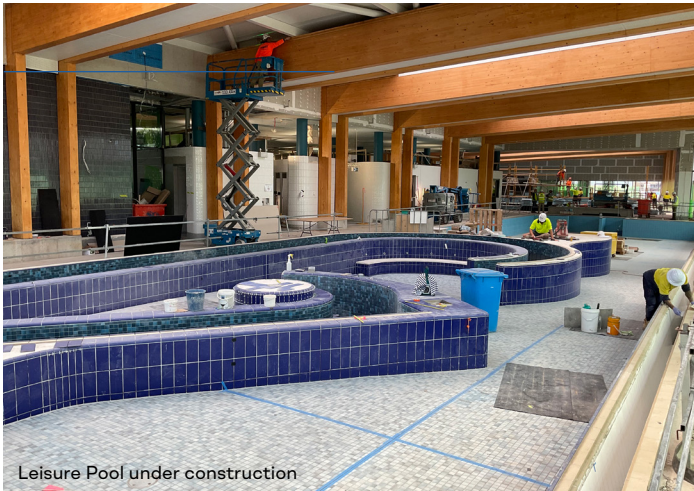
Leisure Pool under construction