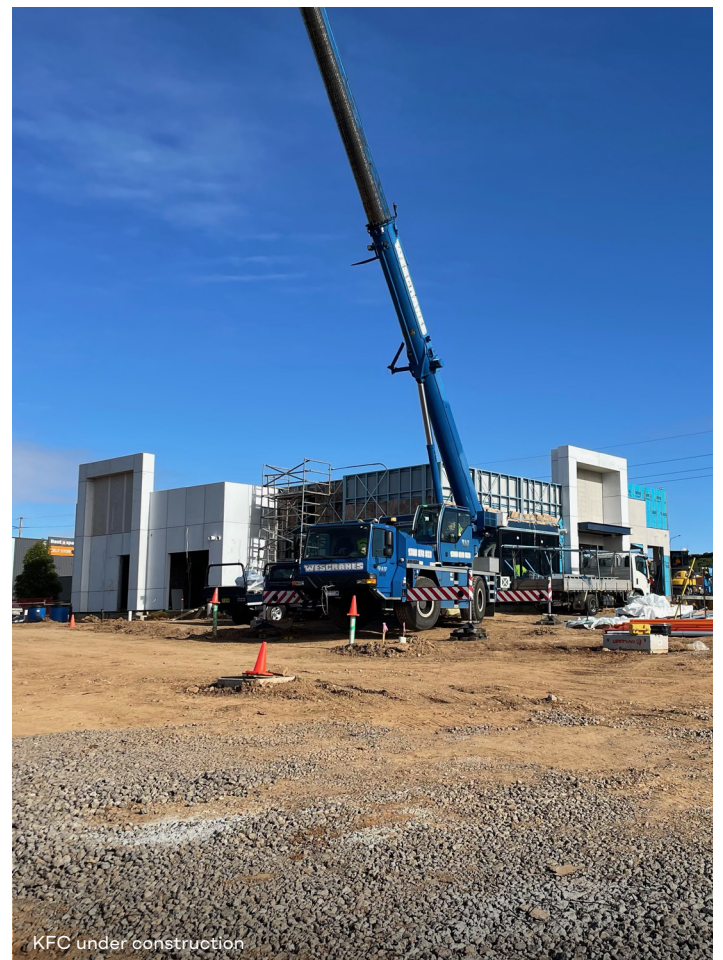
KFC under construction

More businesses will continue to open over the coming months as fitouts are completed.