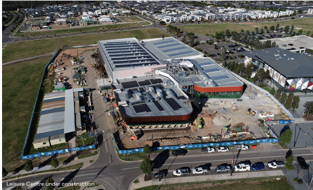
Leisure Centre under construction

We have appointed Glascotts as the landscape contractor after going out to tender earlier this year. They are about to commence on site mid this year. It is expected the facility will be ready to use January 2025.