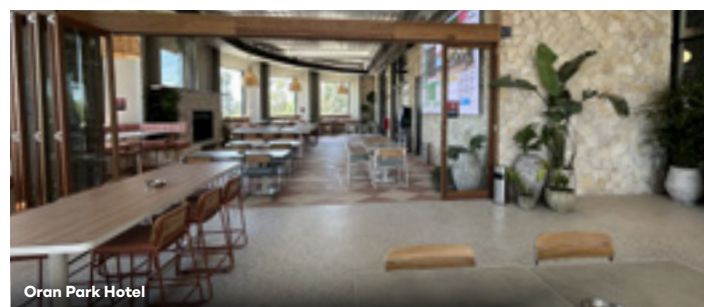
Oran Park Hotel