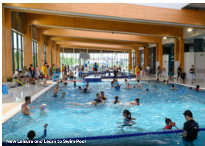
New Leisure and Learn to Swim Pool