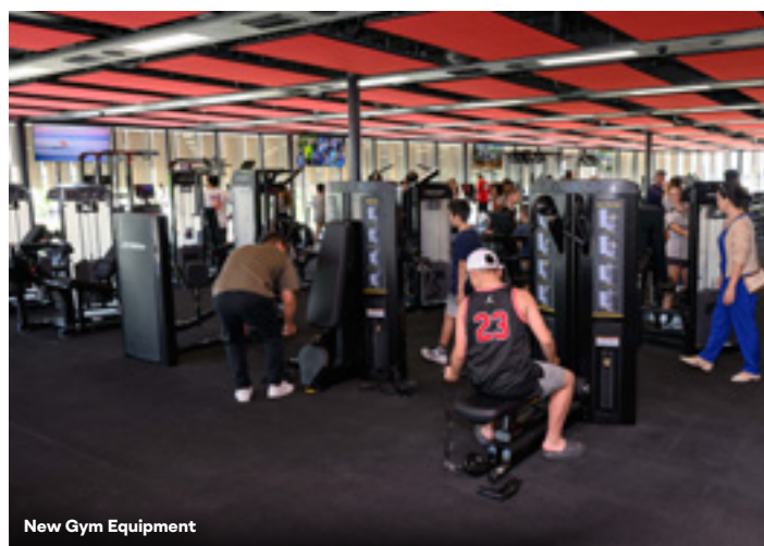
New Gym Equipment