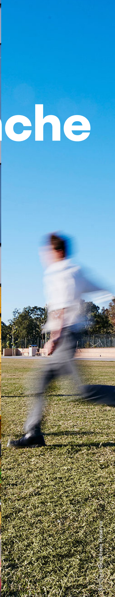
Sir Jack Brabham Reserve