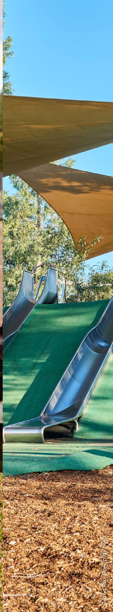
Grand Prix Park play area