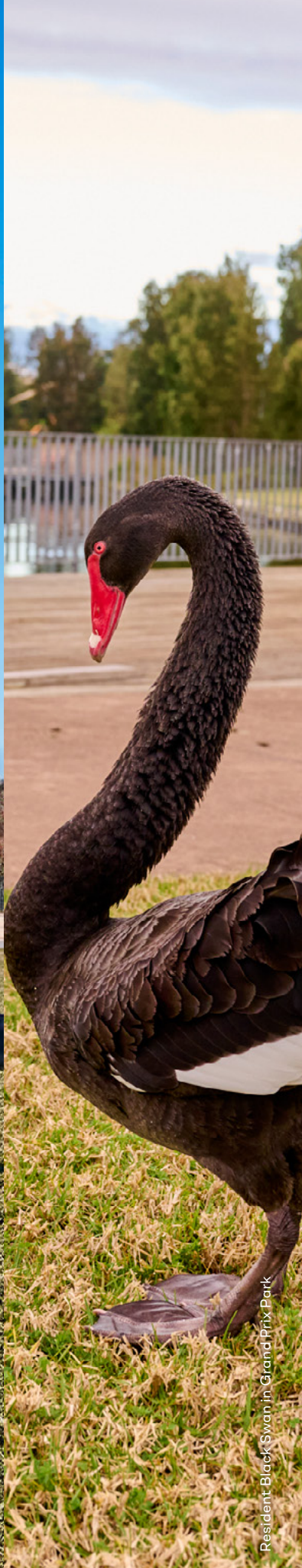
Resident Black Swan in Grand Prix Park