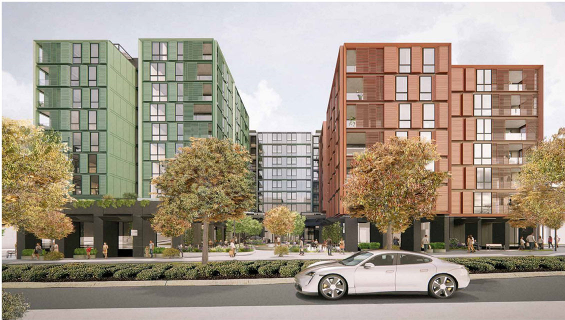
Oran Park Lifestyle Village - view from Civic Way