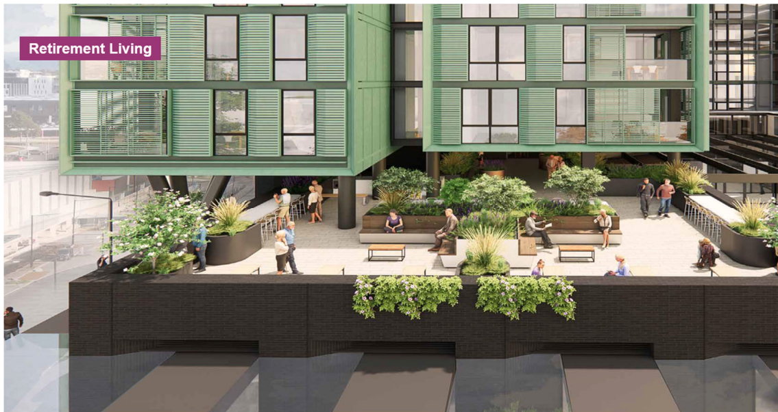
Rendered image of Oran Park Lifestyle Village